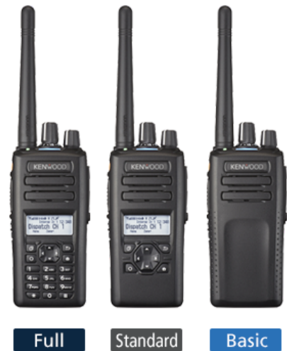
LCD & Key Types

Choose between two portable configurations – one without a numeric keypad and the other with numeric keypad (16-key model). Both styles feature the 4-way Directional-pad (D-pad) and 2-position lever switch.